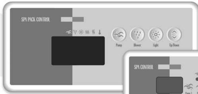
K-19 (7" • 3 1/4")

• Single-Pump & Blower or Dual-Pump System •